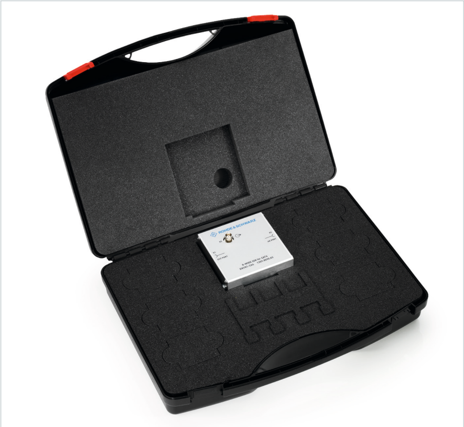
R&S®ENY81-CA6 base unit in carrying case.